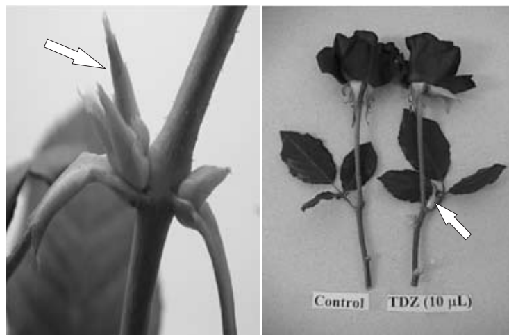
Fig. 1. Lateral shoot development (arrowed) during vase life in cut 'Memoire' (left photograph) and 'First Red' (right photograph) roses pulse-treated with 10 \mu\text{L L}^{-1} TDZ.

as dichloroisocyanuric acid (DICA) (Joyce et al. , 2000) Vase life was assessed daily. Each replicate was 5 individual stems of each cultivar for control and TDZ treatments. A completely randomised design was adopted, and t-tests (Minitab Release 13.1) were used for data analysis for each cultivar.