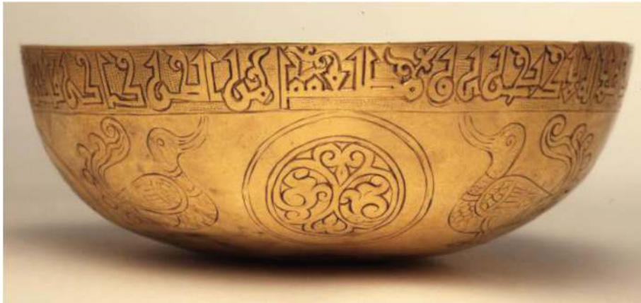
Picture 2. Golden cup with the images of birds, plants, and inscriptions (Dadvar & Zojaji, 2015: 81).

Plant images: in the Iranian art, plants are significant both in terms of economics and tools for expressing the Islamic worldview in the form of visual arts (Enayat, 2008: 36). Images of plants have an especial place in the Islamic arts. These images constitute a large part of decoration in the Islamic arts. In fact, it can be claimed that most Islamic themes such as geometry and arabesque are rooted in the images of plants (Vaziri, 1994: 56). The images of plants including trees – referred to as shajar in Quran – refer to anything which grows on earth (Okhovat, 2009: 75). In the Saljuqid era, different plant images such as cornflower and seven-flower – especially in the Khorasan School of metalwork – were used. The tree of life was used in most of the metalwork of the Saljuqid era (Picture 3). This tree symbolizes heavenly powers, the resurrection day, life and death (Sadagheh, 1999: 142). In most cases, there are guardians standing next to the tree of life, such as real and mythical animals. This means that to reach the tree of life one needs to fight these animals (Debucoart, 1994: 13). One can mention the cypress tree as another example of plant image used in the metalwork of the Sassanid era.