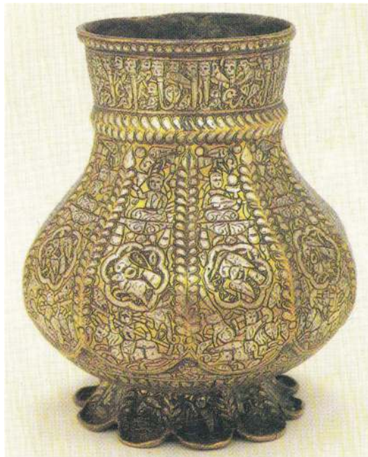
Picture 1. Human images with the themes of music and hunting on bronze urn (Ward, 2005: 56)

Human images: the use of human images in different forms such as, musicians, drinkers, horse-riders, hunting images, accession to thrones, mythological scenes and stories. The most widely used human images in the decorations of the Iranian art reflect parts of the court life (Shayestefard, 2005: 60). This includes hunting images, court life, sports, music, and war scenes (Picture 1). One of the most famous war images engraved on the objects in the Saljuqid era is about the siege of the Merv castle by Sultan Sanjar and his troops, which is found on a bronze pot in Dagestan, and is currently kept in the Hermitage Museum. In the war scenes, the warriors are shown as mounted and dismounted usually in pairs and fighting with different war equipment such as swords, daggers, shields, bows and arrows, and mace (Heydarabadian, 2009: 30). This method of decoration was initially used for recording historical events but in the Islamic period it was used for representing war scenes (Tohidi, 2007: 54).