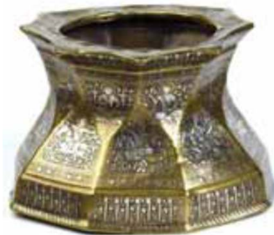
Picture 3. The candlestick in Iran's National Museum; it has inscriptions, human and animal images, geometric themes, and plant images such as the cypress tree (Bani-Emam, 2016: 35).

Plant images: in the Iranian art, plants are significant both in terms of economics and tools for expressing the Islamic worldview in the form of visual arts (Enayat, 2008: 36). Images of plants have an especial place in the Islamic arts. These images constitute a large part of decoration in the Islamic arts. In fact, it can be claimed that most Islamic themes such as geometry and arabesque are rooted in the images of plants (Vaziri, 1994: 56). The images of plants including trees – referred to as shajar in Quran – refer to anything which grows on earth (Okhovat, 2009: 75). In the Saljuqid era, different plant images such as cornflower and seven-flower – especially in the Khorasan School of metalwork – were used. The tree of life was used in most of the metalwork of the Saljuqid era (Picture 3). This tree symbolizes heavenly powers, the resurrection day, life and death (Sadagheh, 1999: 142). In most cases, there are guardians standing next to the tree of life, such as real and mythical animals. This means that to reach the tree of life one needs to fight these animals (Debucoart, 1994: 13). One can mention the cypress tree as another example of plant image used in the metalwork of the Sassanid era.