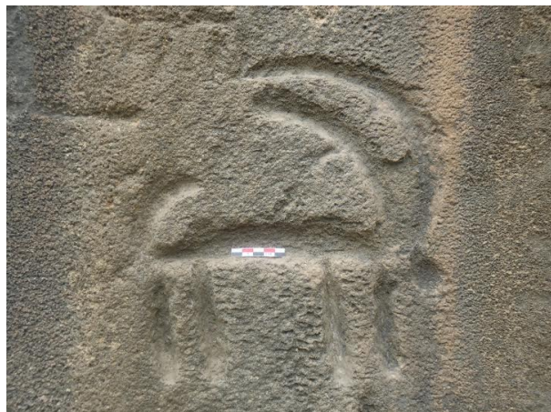
Figure 3. Ibex in complex 1.