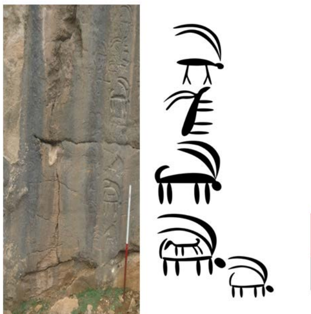
Figure 2. Ibexes in complex 1 at Tang-e Birzal.

In a 5 meters away from the complex 1, there is another brown-orange rock with the goat picture again, but its face has severely damaged as such that its reliefs have disintegrated, nevertheless we can see a folk of the mountain Ibex. These reliefs are like reliefs of the complex 1, but these samples have longer ancientness. In fact, these reliefs have created by the scratching or hitting styles and they have a 1 - 2 mm depth and 0.5 - 2 cm width. These Ibex have linear hands and feet, longed bodies, bow-like and big horns, hung down heads and face toward to the southern point. It is worthy to note that the two Ibex are bigger than other ones, this maybe has a special concept or the artist would like to make a variety ( Figure 4 ).