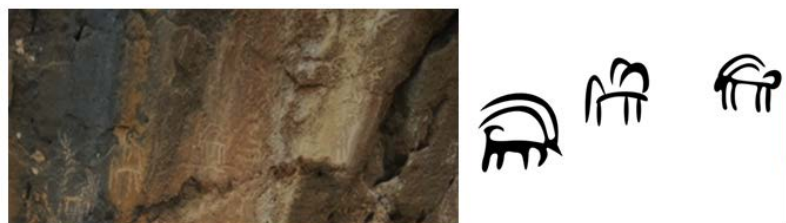
Figure 4. Ibexes in complex 2 of Tang-e Birzal.